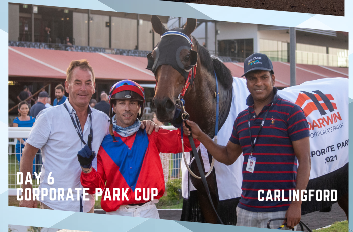
DAY 6 CORPORATE PARK CUP