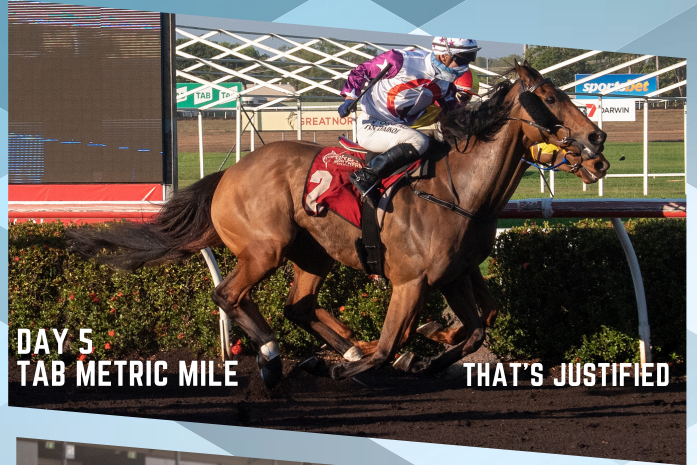
DAY 5 TAB METRIC MILE