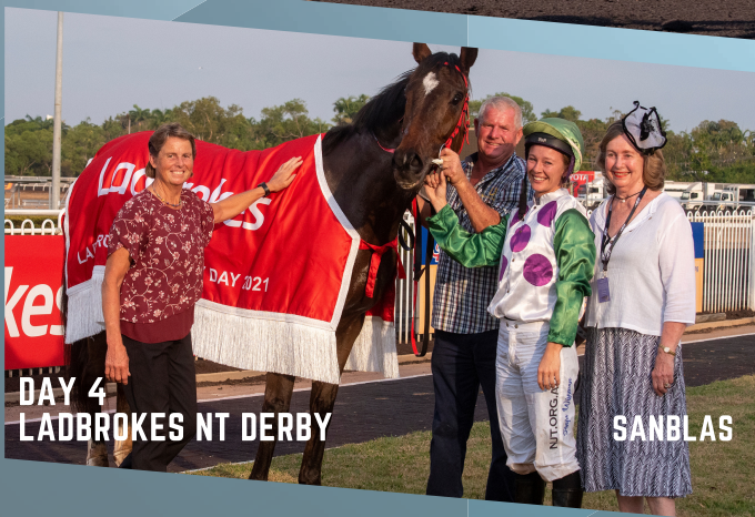
DAY 4 LADBROKES NT DERBY