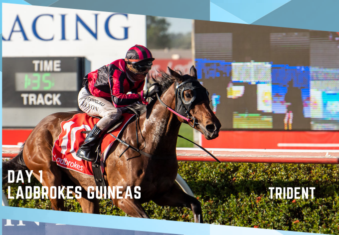
DAY 1 LADBROKES GUINEAS