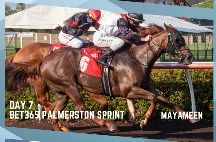
DAY 7 BET365 PALMERSTON SPRINT