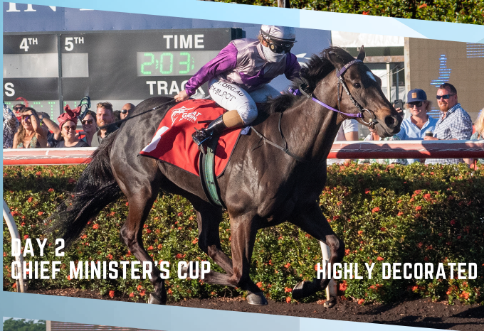
DAY 2 CHIEF MINISTER'S CUP