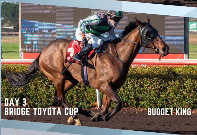
DAY 3 BRIDGE TOYOTA CUP