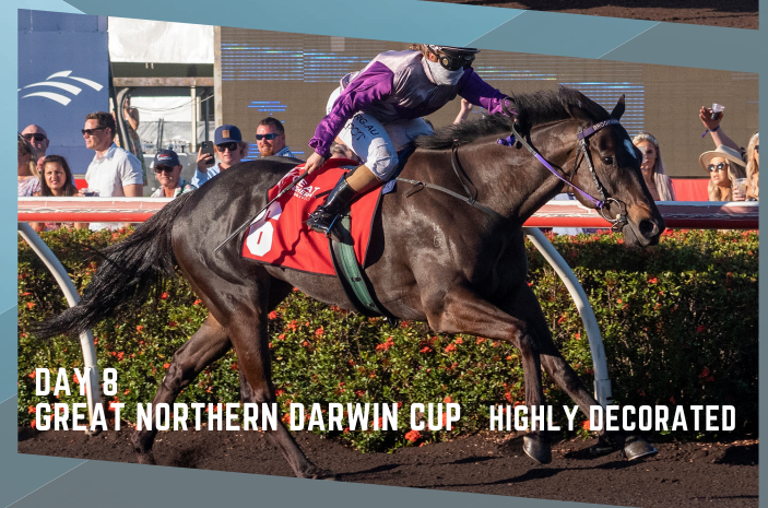
DAY 8 GREAT NORTHERN DARWIN CUP